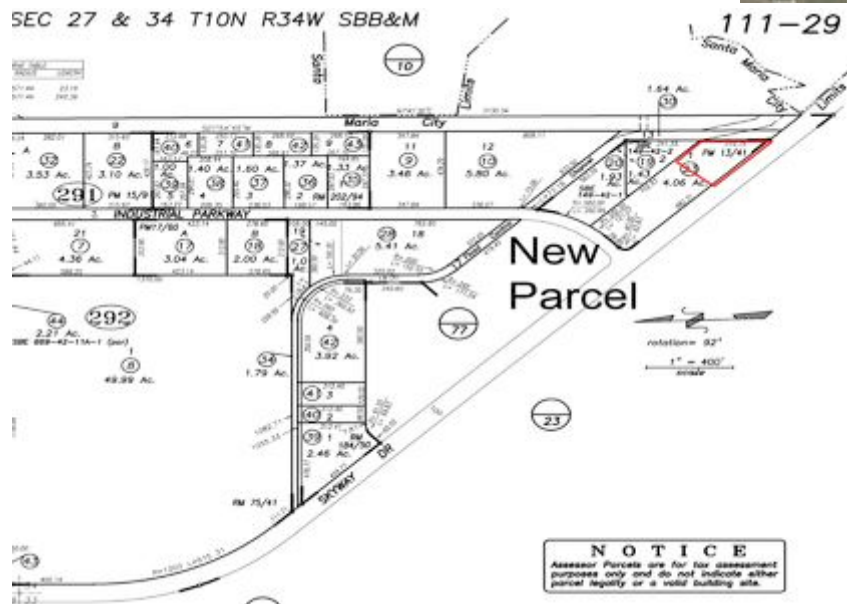
APNs and adjoining parcels