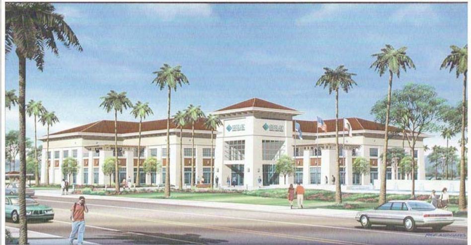
Financial Headquarters Concept Plan